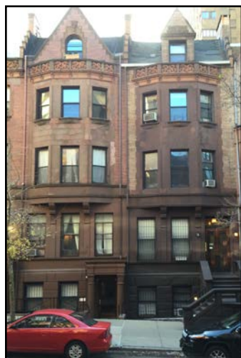
318 & 320 West 104th Street

318 is an example of this. True also varied his facades by using different shades of brick—gray, cream, yellow, orange, but rarely brick red.